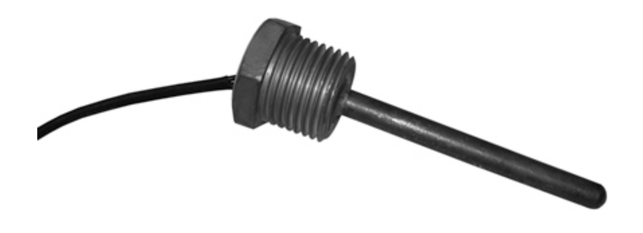
EB120 Temperature Probe